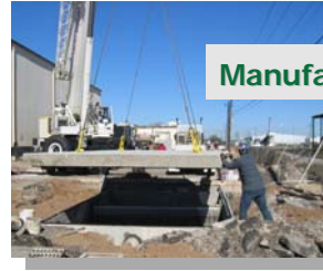
Manufacturing Facilities – Texas