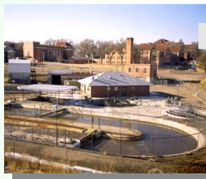
Wastewater Treatment Plant - Colorado