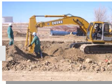
Construction Projects Nationwide